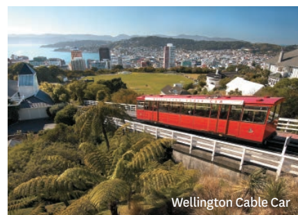
Wellington Cable Car