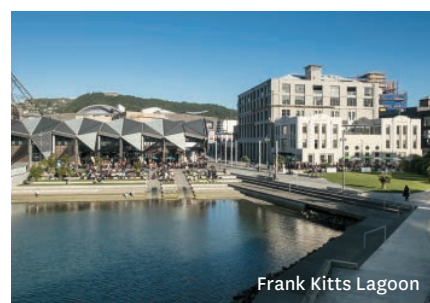
Frank Kitts Lagoon