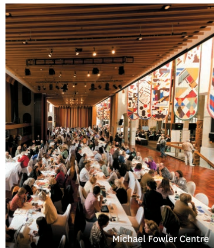
Michael Fowler Centre

VISIT the nearby region of Wairarapa, only an hour's drive or train ride from Wellington.